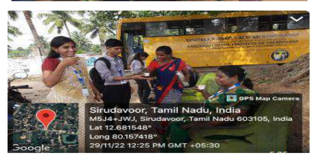
THE REFRESHMENT VOLUNTEERED BY AN VILLAGER